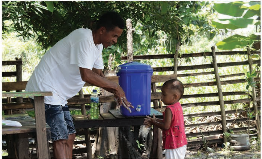
Father in Belu District is teaching his child on hand washing with soap

What is a surprise for them both is when some men, claiming to be heads of families, refuse to share the roles with their wives in doing house chores and taking care of their own children. They listened to the opinions of male participants, who mostly are heads of families during a discussion The Role of Fathers in Childcare held by Plan Indonesia in 2019.