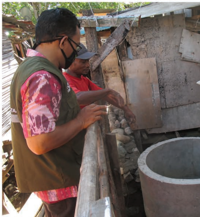
The Jenilu Village STBM-Gesi Team conduct consistent approach and monitor the implementation of community-based latrines construction.

Officials from Atapupu Health Centres, including Sanitarian, Health Promotion officers, Sub-district STBM Team, and Belu District Health Agency also visited the subvillages. The team initiated the village activity by socializing the Five STBM Pillars along with the establishment of Village STBM Team. They received capacity building on how to do triggering and awareness campaign of clean and healthy living through the STBM-GESI.