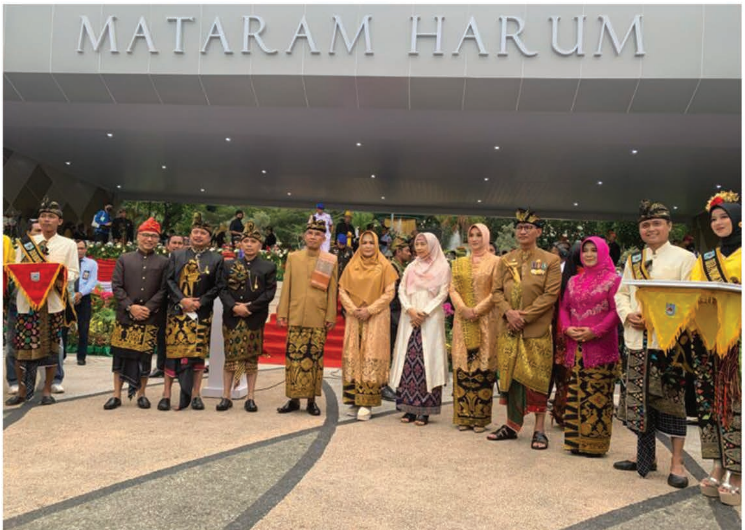
5 STBM Pillars Declaration of Mataram City was celebrated during the 29th Anniversary of Mataram which celebrated on 31st August.

Furthermore, Dini said,, Plan Indonesia always encourages the active participation of the community, including marginalized groups, in sanitation and hygiene development in all of its working areas. Plan Indonesia believes that all community members, including girls, youth, and persons with disabilities, have the right and potential to participate in sanitation development and must be continuously supported. "I express my appreciation to the City of Mataram, which is highly committed to encouraging the active participation of marginalized groups in the implementation of the 5 Pillars of STBM and menstrual hygiene management activities so that this city becomes an inclusive and female-friendly city," said Dini. He continued, "Hopefully, this can be sustainable and replicated by other regions in Indonesia," said Dini.