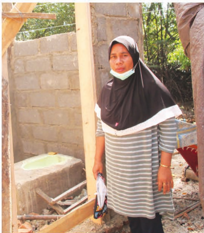
Fishermen community of Jenilu Village finally has their own latrine and no need to defecate openly.