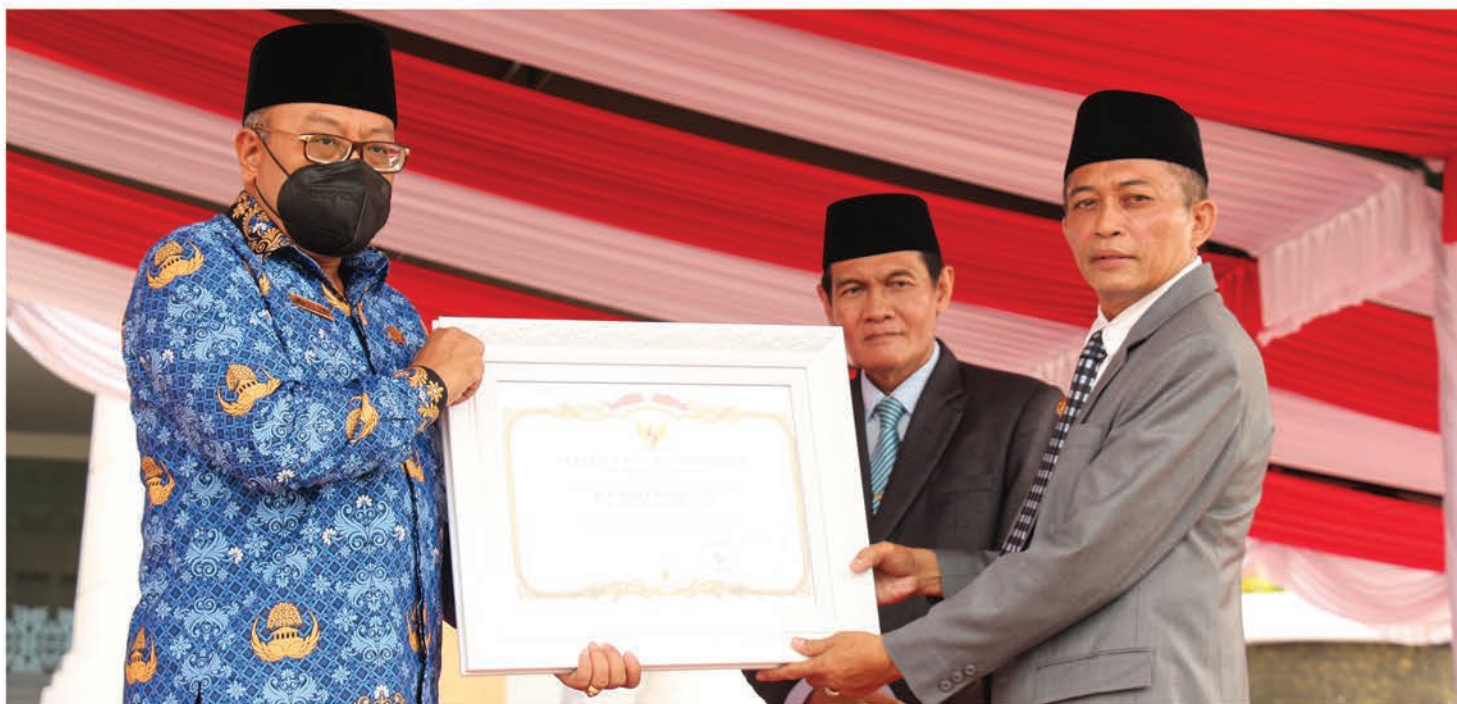
Regent of Lombok Tengah, NTT, Lalu Pathul Bahri (in gray suits), proudly shows the certificate of achievement of STBM Pillar 1-3.