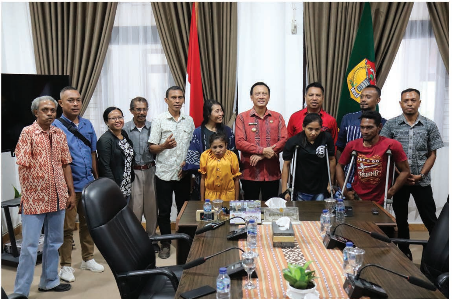
Belu District Head providing great support on GESI STBM promotion conducted by Kumpesa Rai Belu (disability people organization) reaching marginalized group in the community

In Belu, there are 17 Puskesmas to spearhead the STBM-GESI socialization. Now, they have the fullest support from the Belu District Government. What is interesting in campaigning and socializing STBM to the target communities is the involvement of a disability organization called Kumpesa. They also collaborating with sanitarians and the local cadres, strengthened with the Regent's support.