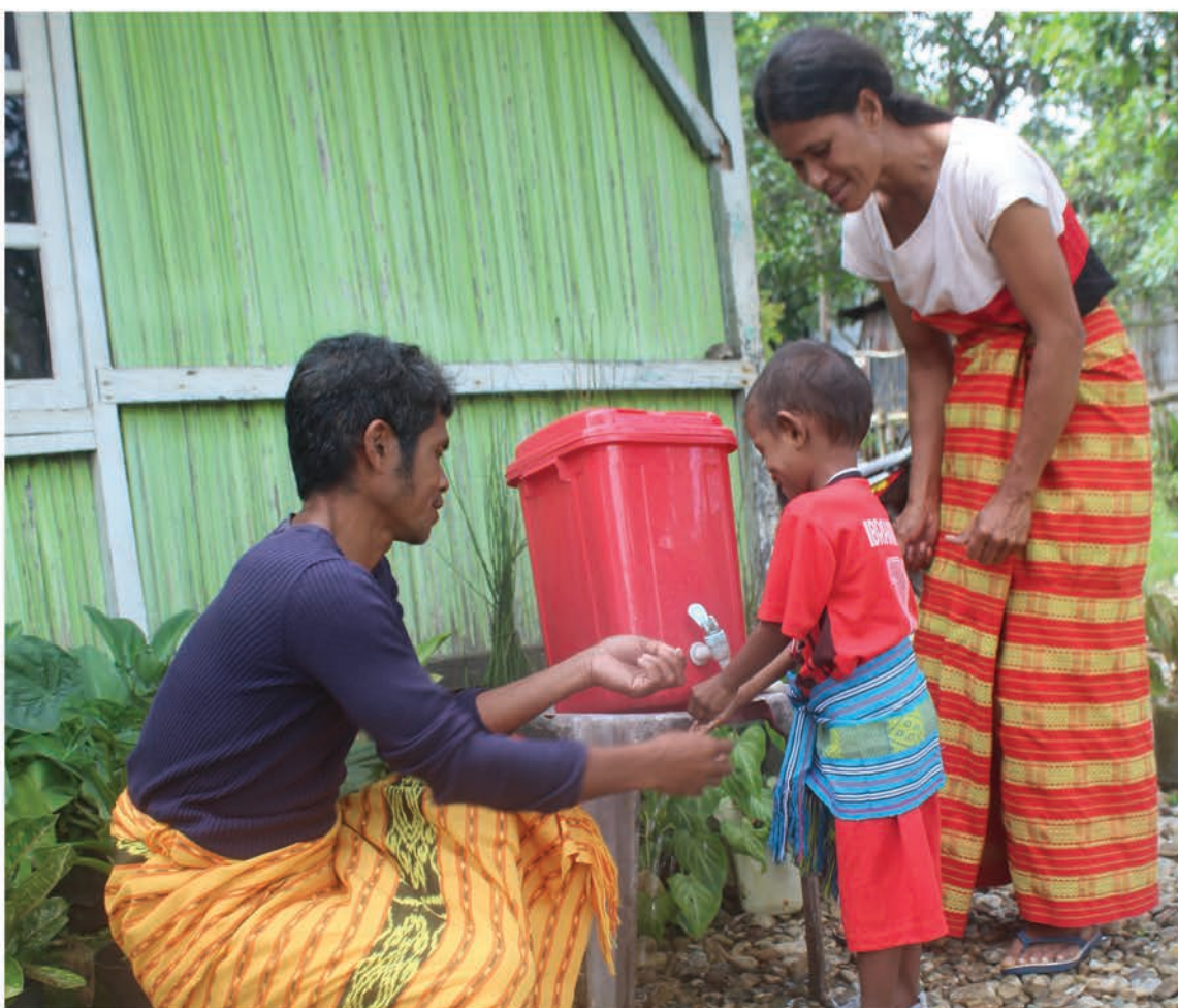
STBM activities in child care is one of the nutrition sensitive intervention that could contribute to stunting reduction

Furthermore, Rene added that the STBM-GESI approach through WINNER in 36 villages has now achieved 100% Stop Open Defecation. In December 2022, they hosted a major celebration when declaring that Belu District reached 100% ODF. Now, they want the STBM Teams established in the villages to pursue the remaining four pillars.