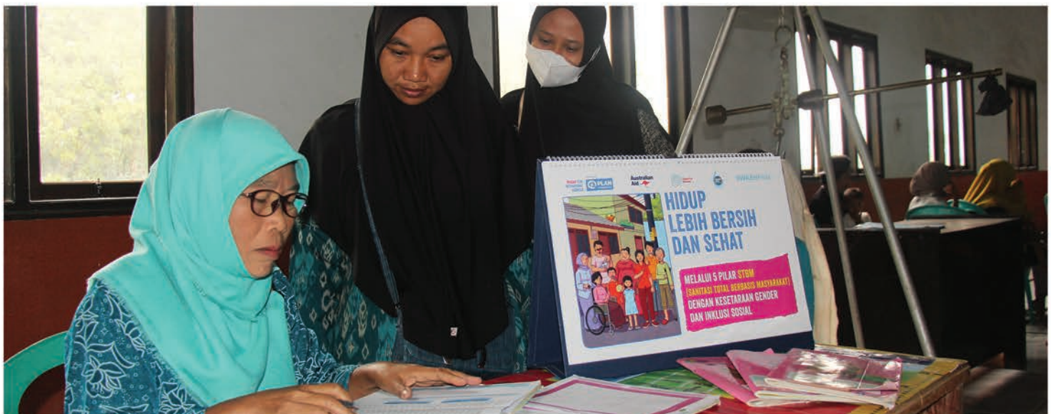
Jointly evaluating the STBM socialization results

Wiranita added that his agency already established 100 Waste Care Group in remote villages, but they have no activities due to the recent pandemic. Yet, some villages have managed their waste successfully by establishing Waste Bank, and even generated economic benefits for the caretaker. Now, Lombok Tengah District Government is preparing 800 ha of land (from previously just 500 Ha) for waste management. This is still underway and is expected to be finished in 2023.