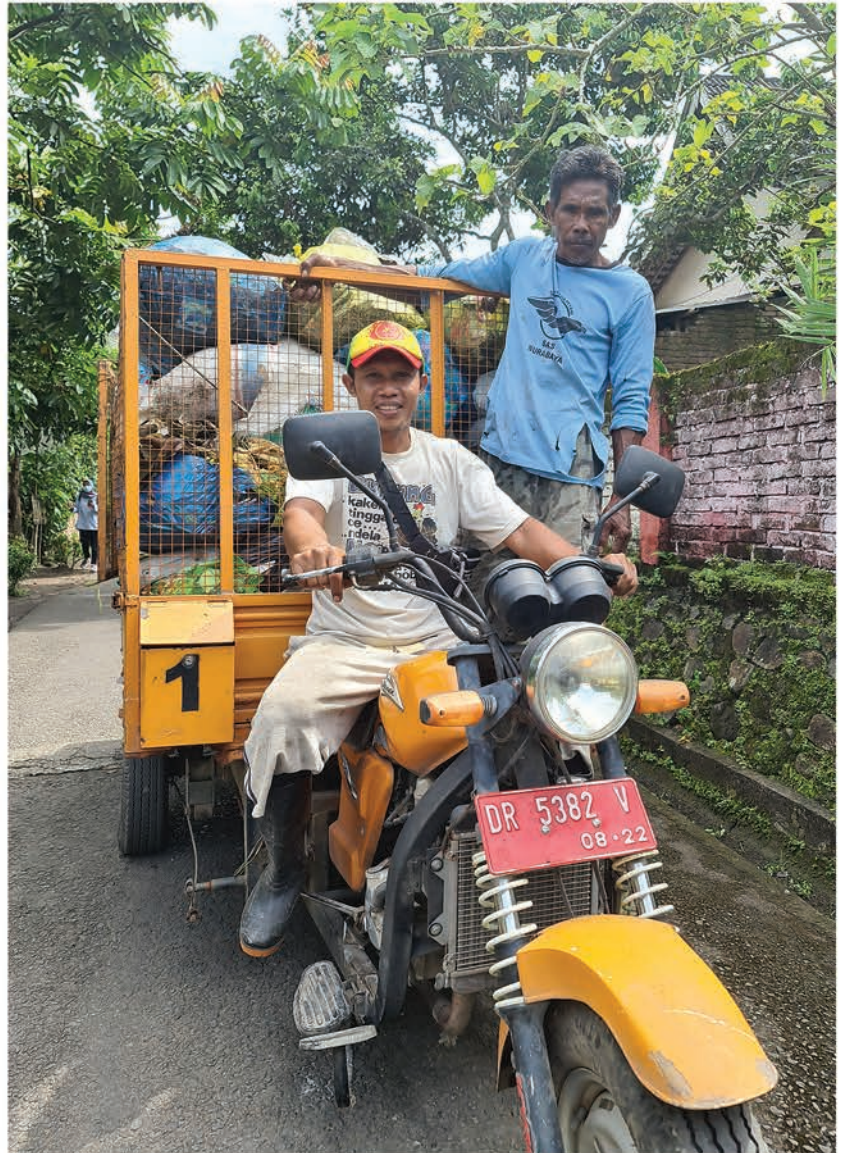
Kopang Rembiga Village is one of the villages in Loteng succeeded in completing 5 STBM Pillars.

No wonder that Kopang Rembiga Village is now transformed into a beautiful and clean village. It is known as a Tourism Village and has been declared as one of four villages in Lombok Tengah District which have completed the 5 STBM Pillars consistently.